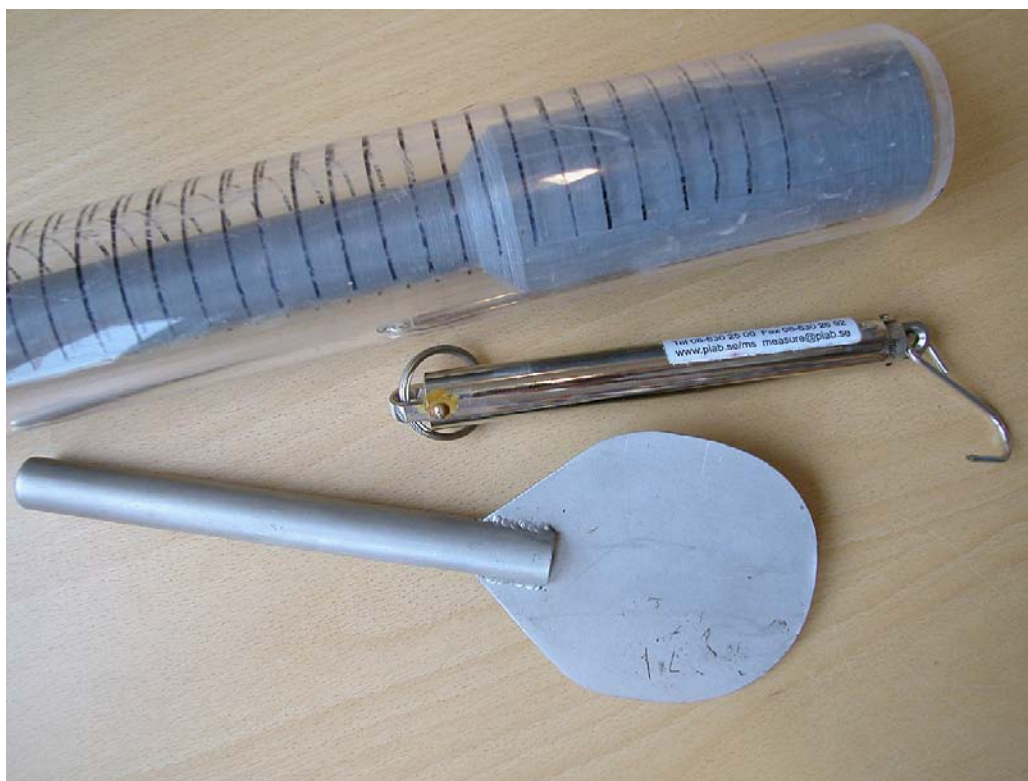
Figure 3-1. Equipment used to measure snow depth and snow weight.

The observations of ice freeze-up and ice break-up were performed by visual inspections.