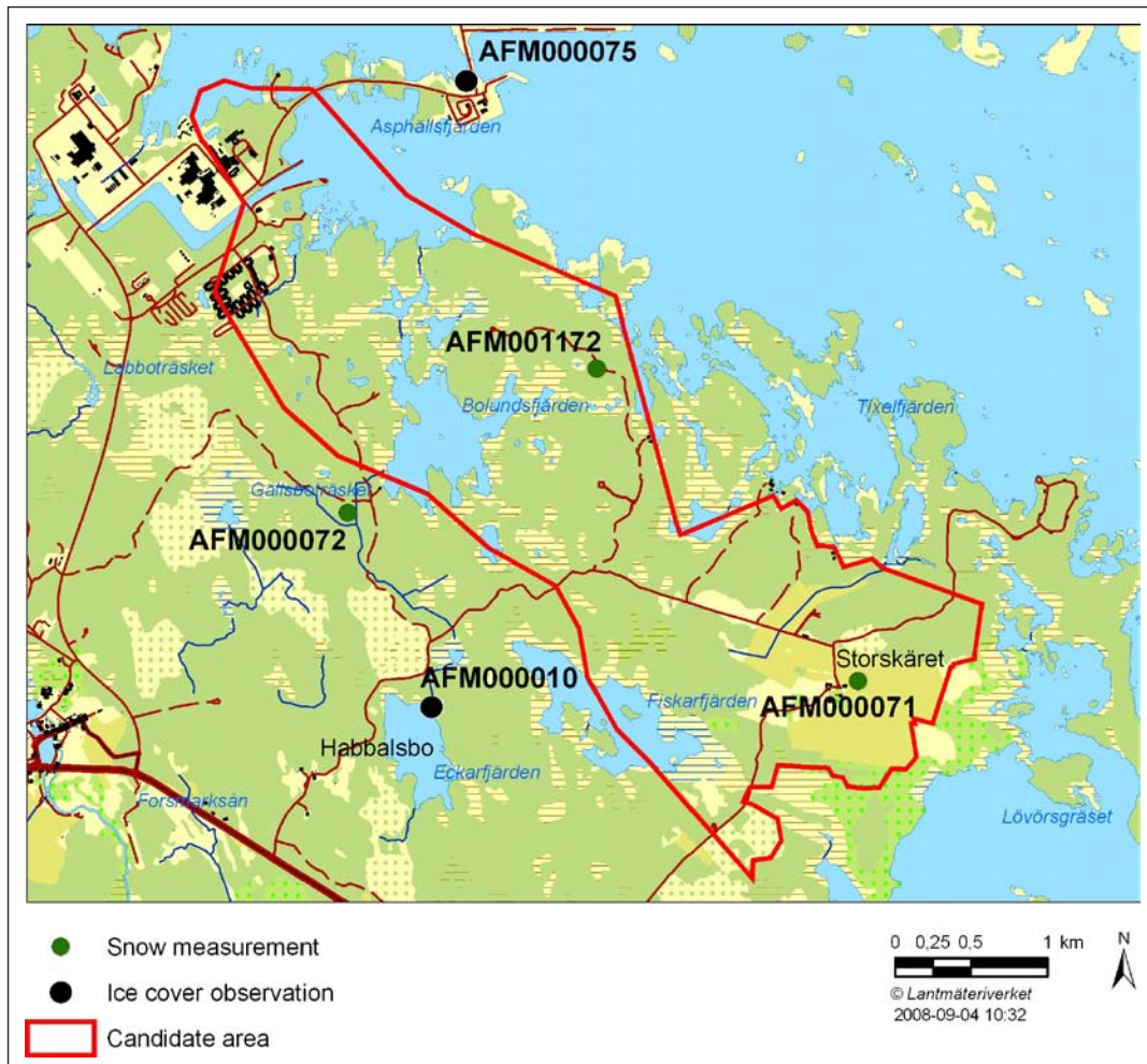
Figure 1-1. Locations of measurements and registration of meteorological winter parameters.

The three parameters, snow depth, snow weight and duration of ice cover, were measured and registered in the field. The water content of the snow was calculated using the results from the snow weight measurements. The map in Figure 1-1 below shows the positions for the measurements. The activity was performed from January until the beginning of April 2008. No observations or measurements were made within this activity during the autumn 2007.