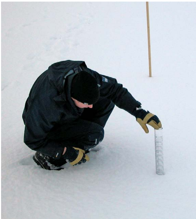
Figure 4-1. Measurement of snow depth with plastic tube at Storskäret, AFM000071.

The snow depth was measured at 6 points within each sample station and the average depth of the station was calculated. The depth was measured with a transparent plastic tube which also was used to take snow samples for water content determination. The tube was pressed down through the snow layer until it hit the ground and the depth was measured to the nearest centimetre, see Figure 4-1.